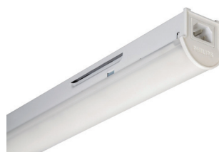
Trunkable (diffused option shown)

The Philips GreenPerform LED Batten is a high quality LED batten that's at home in a variety of applications, from warehouses to corridors and storage spaces. The high system efficacy delivers significant energy savings of up to 50% as compared to conventional T8 battens. The reliable and robust housing structure maximises the durability and contributes to the GreenPerform's long lifetime. With its flexible optics and mounting accessories, the GreenPerform LED Batten is suitable for symmetrical, asymmetrical, direct and indirect lighting applications.